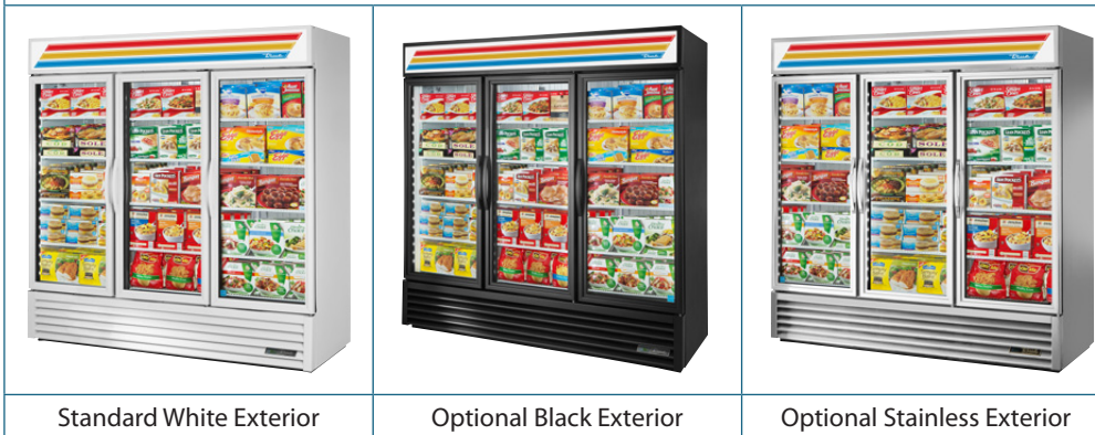
Standard White Exterior