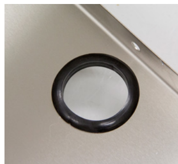
ELECTRIC CORD CUT-OUT WITH RUBBER GROMMET